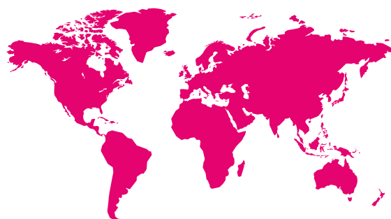
Worldwide NPQ Delivery

Professionally, NPQEL graduates may choose to apply for executive leadership roles such as CEO or COO of a MAT, executive headteacher posts or similar.