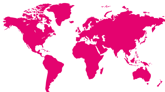
Worldwide NPQ Delivery

Professionally, NPQH graduates may choose to apply for a headship or system leadership role, such as national leader of education (NLE) or teaching school director.