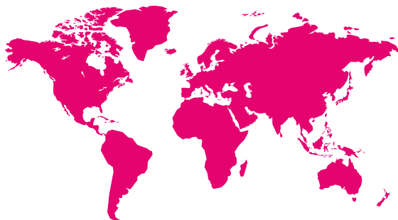
Worldwide NPQ Delivery

Professionally, those who have successfully completed the NPQLT go on to lead teaching in a subject, year group, key stage or phase.