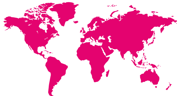
Worldwide NPQ Delivery

Professionally, those who have completed the NPQLTD go on to lead the professional development of teachers in their school through designing and/or delivering effective CPD.