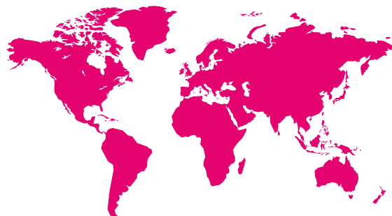
Worldwide NPQ Delivery

Professionally, NPQSL graduates may choose to apply for senior leadership or system leadership roles such as deputy head, specialist leader of education (SLE) or teaching school director.